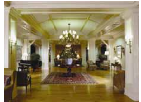
Inn lobby and Tartan Room

Go to www.seapines.com for more pictures