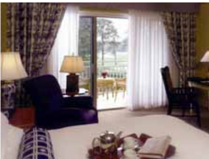
Inn room and exterior